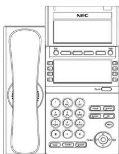
Dual Screen 8 Button

From this key, the user may access additional functions such as Call History and Directory